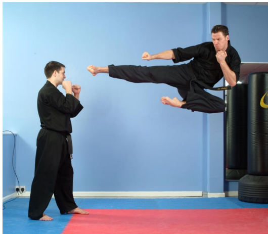
(Caption): BMMA provides positive role models from the armed services for today's children